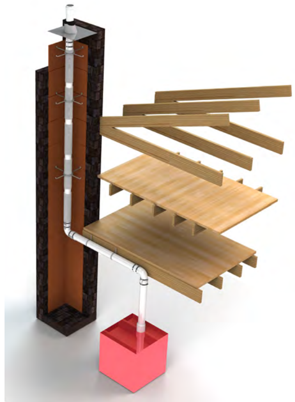
Installation into a Masonry Chimney